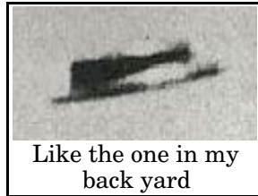
Like the one in my back yard

I walked over to the back door and looked out. There was a flying saucer sitting on the grass. It was your typical, garden-variety, classic, vintage flying saucer, just like people have been seeing for all of the previous century and probably long before that. I found a picture of one a lot like it on the internet. Here it is.