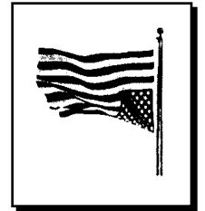
Nation in Distress